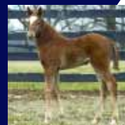
Johar-Hawa Mahal Colt