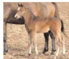
Colt out of Multiple SW ALL THE HONOR at Equus Farm