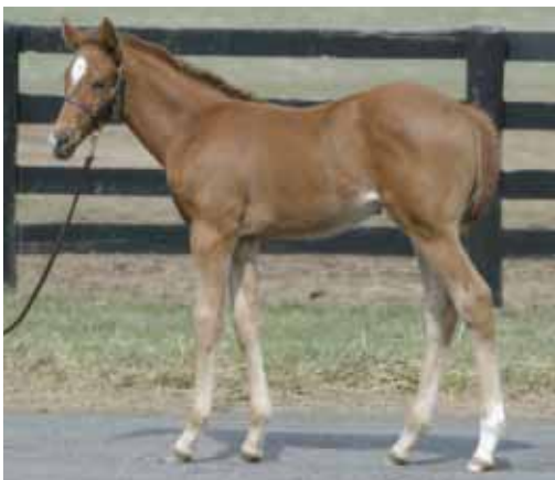
Filly ex Plenty of Stars