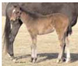
Filly out of SW & SP MERRY DEPUTY at Briarbrooke Farm