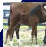
Johar-Hello Soso Filly