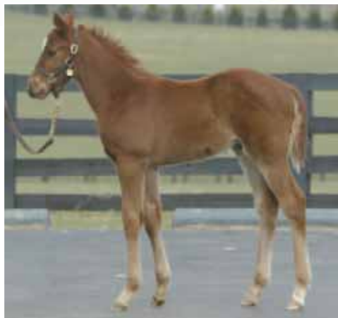
Colt ex Good Vibes

"The foals I have seen by Lion Heart have good bone & are tremendously well built, they look very fast types"